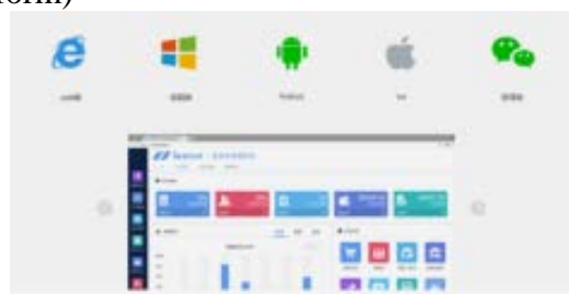
Figure 2 Microsoft.net platform

ASP.Net as a Web application development technology, it is based on the Microsoft.net platform, on the common language running platform,. All the functions of the net Framework can be used. Using this technology to develop programs for exception control can play a supporting role, maintain type security, achieve inheritance and dynamic compilation.A variety of support surfaces can also be fully utilized in ASP.net programs to program control logic to a strong type of language. (Figure 2: Microsoft.net Platform)